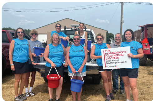
New Ulm Bavarian Blast, July 23