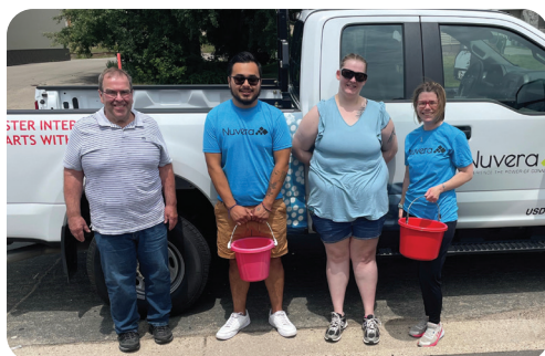
Hutchinson Jaycee Water Carnival, June 18

The Nuvera team had a great time seeing so many friends and customers at parades all across our service areas this summer! Here are just a few photos from our parade participation.