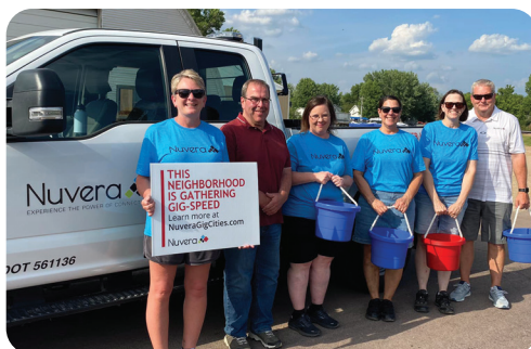
Springfield Riverside Days, June 23