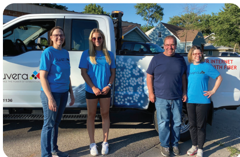
Litchfield Watercade, July 8