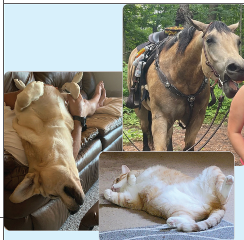
Nuvera recently held a pet contest internally to raise money for local animal shelters. Employees could pay to cast their votes for their favorite pets and these are our winners in three categories: Hank (dog), Chester (cat) and Hotshot (other).

In 2023, Nuvera will perform similar improvements to our business website, nuverabusiness.com . ♦