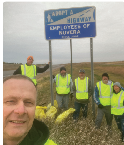
Nuvera's Adopt-A-Highway crew helped keep Minnesota beautiful, cleaning up our stretch of Hwy 15 near New Ulm in mid-October.